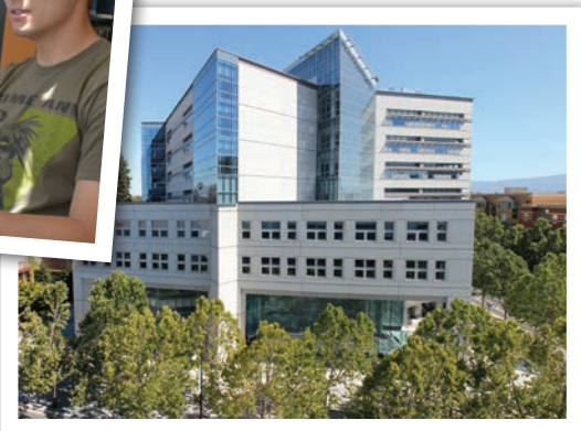
DR. MARTIN LUTHER KING, JR. LIBRARY