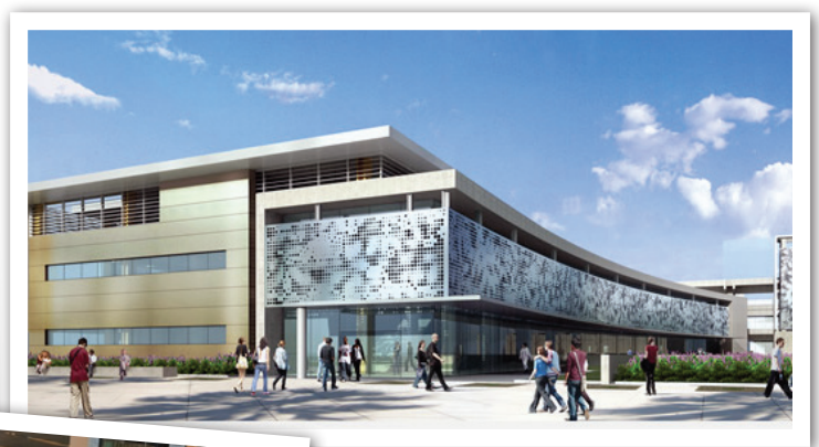
NEW STUDENT UNION TO BE COMPLETED 2014