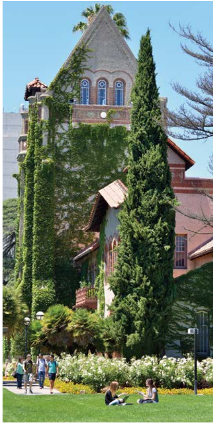
SHARON HALL ES-ENF-0215-V1